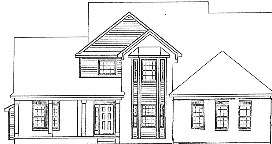
ELEVATION - B