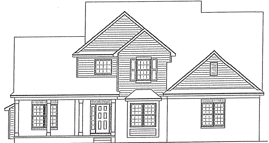
ELEVATION - A